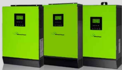
InfiniSolar V-1K-12 InfiniSolar V-2K-24 InfiniSolar V-3K-48 InfiniSolar V-4K-48 InfiniSolar V-5K-48